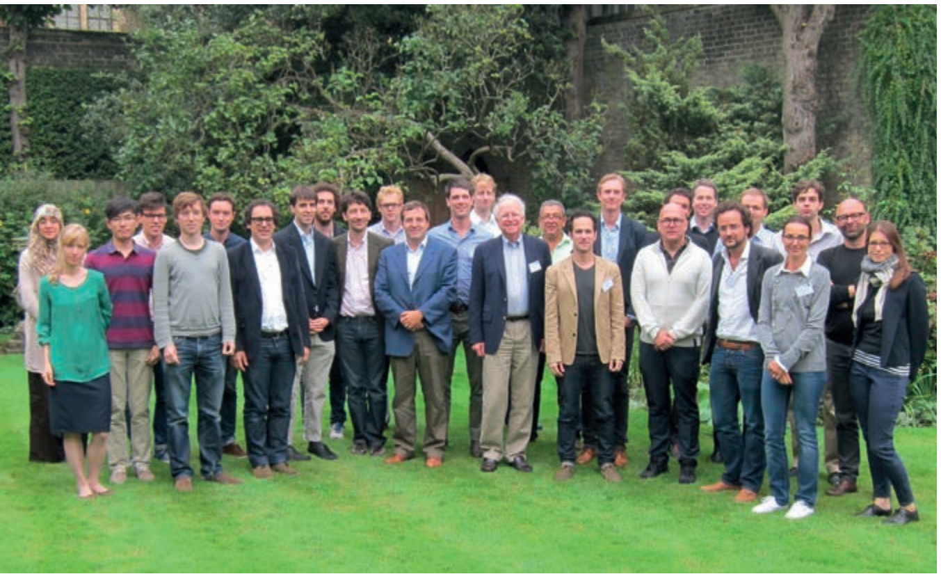
Aggregate Demand, the Labor Market and Macroeconomic Policy