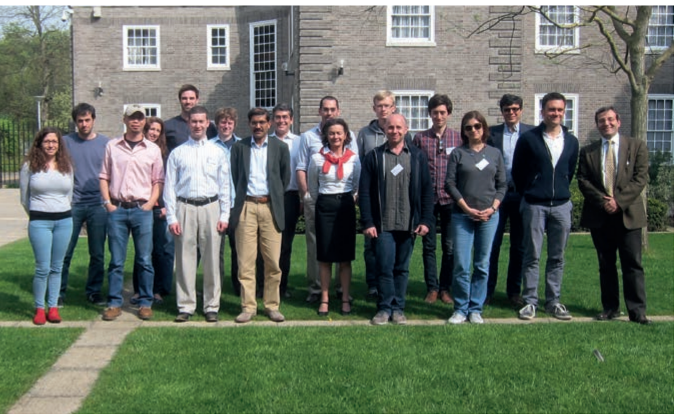
Symposium on Contagion