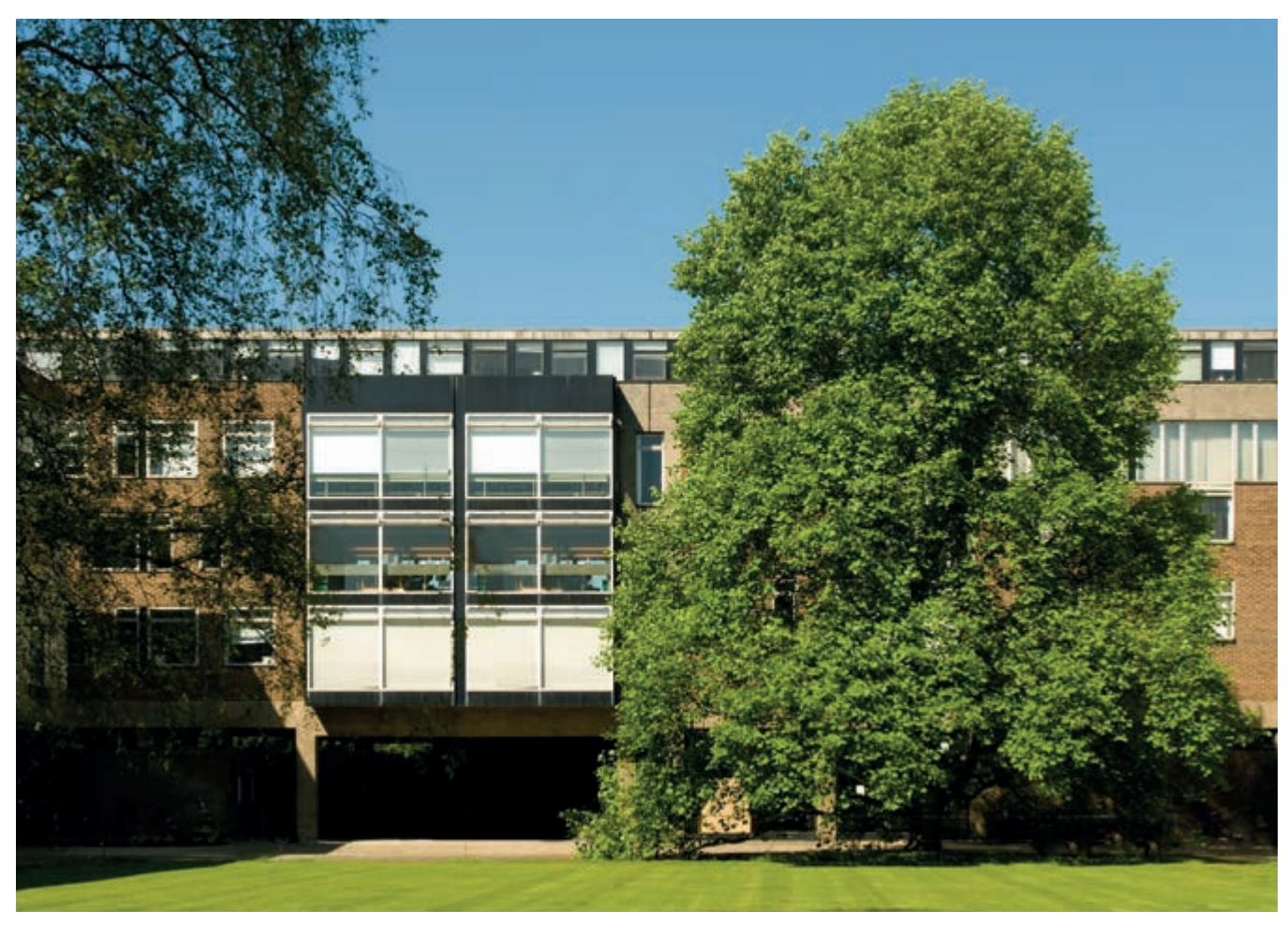
The Cambridge-INET Institute