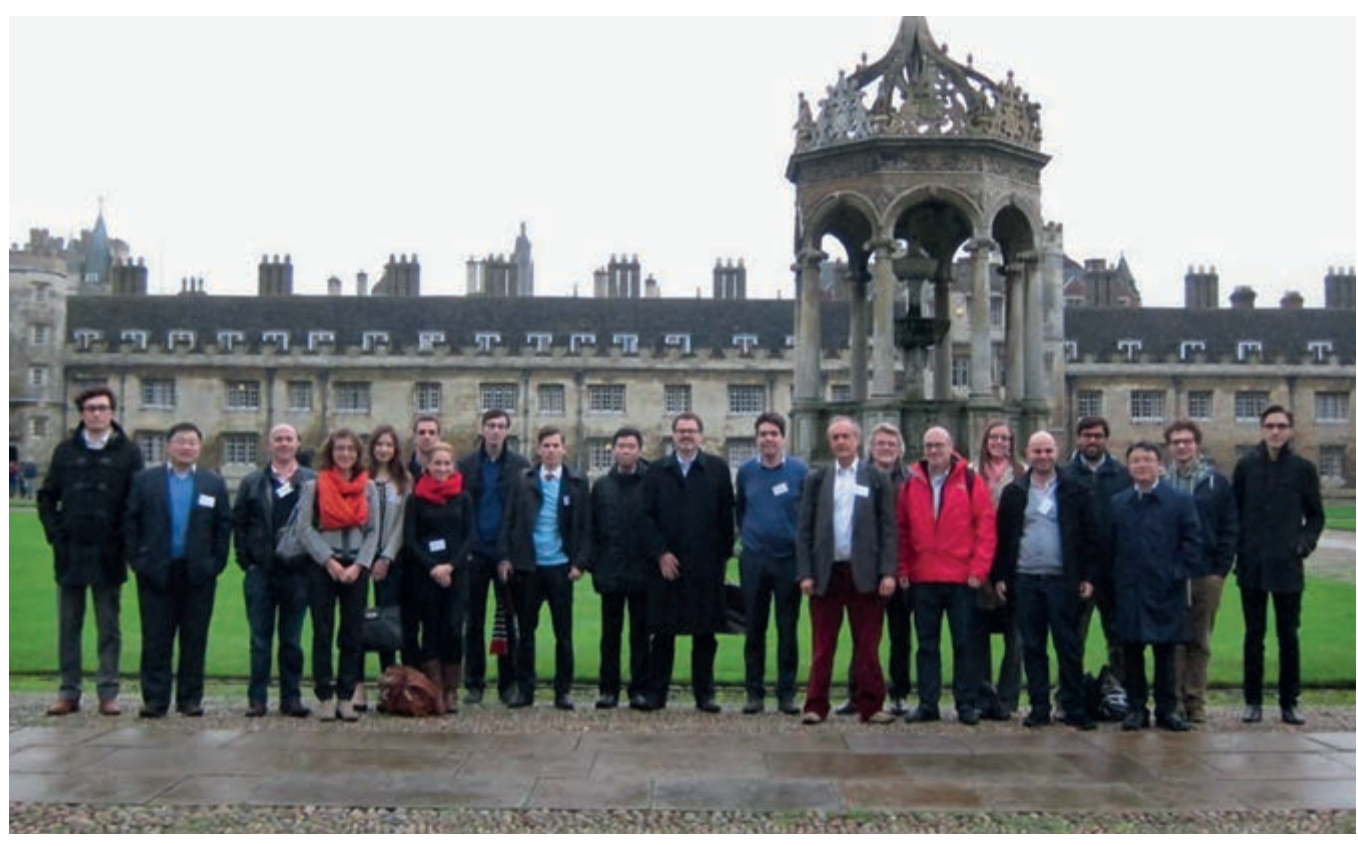
Empirical Market Microstructure Workshop